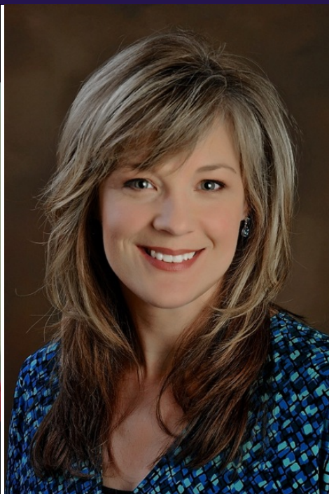
Lhay Thriffiley April 15